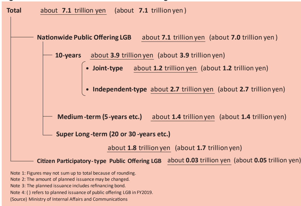
Fig. 2-39 Planned Issuance of Public Offering LGB in FY2020

The method of issuance includes “issuance for offering/underwriting by a syndicate composed of financial institutions and securities companies (“Underwriting Syndicate”),” “issuance for offering/underwriting led by the lead manager,” and “issuance for offering/underwriting by auction.” Issuance terms were discussed and deliberated on from April 2002, and were set out in two tables: one for Tokyo Metropolitan Government Bonds, and the other for other local government bonds. In 2004 and 2006, the method for determining the appropriate terms was revised, and now each local government issuer decides on the terms of each issue separately and independently.