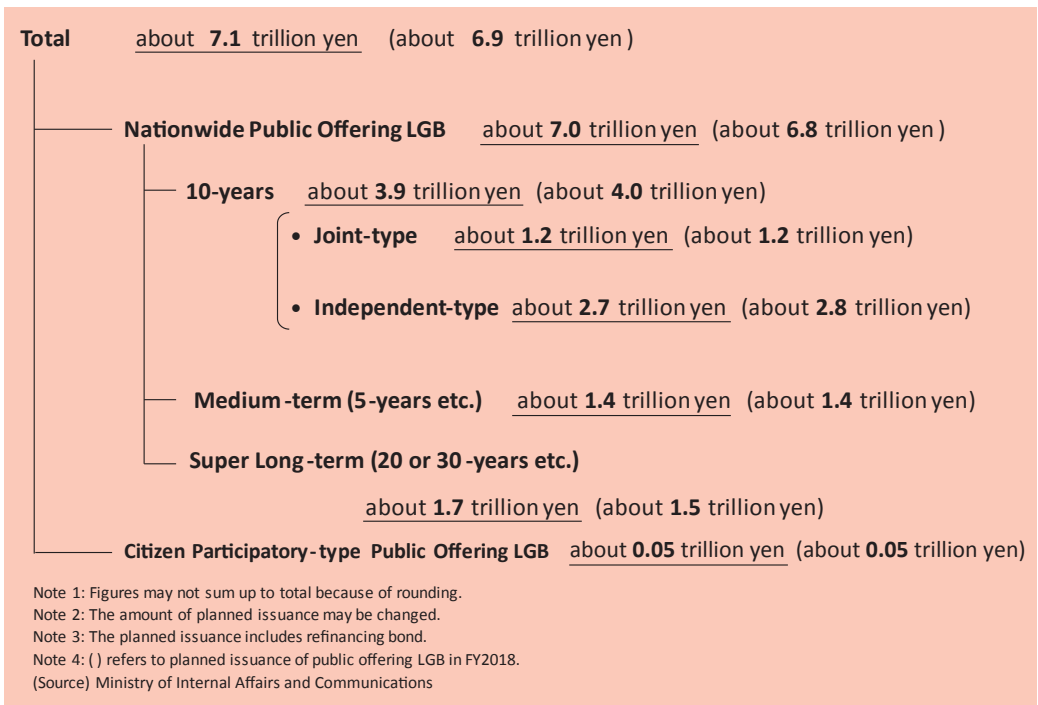
Fig.2-38 Planned Issuance of Public Offering LGB in FY2019

The method of issuance includes “issuance for offering/underwriting by a syndicate composed of financial institutions and securities companies (“Underwriting Syndicate”),” “issuance for offering/ underwriting led by the lead manager,” and “issuance for offering/ underwriting by auction.” Issuance terms were discussed and deliberated on from April 2002, and were set out in two tables: one for Tokyo Metropolitan Government Bonds, and the other for other local government bonds. In 2004 and 2006, the method for determining the appropriate terms was revised, and now each local government issuer decides on the terms of each issue separately and independently.