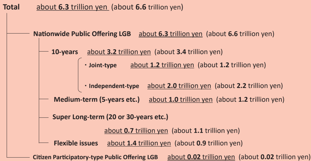
Fig. 2-38 Planned Issuance of Public Offering LGBs in FY2023